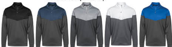
Black/Charcoal Navy/Charcoal Pebble/Charcoal White/Charcoal Team Royal/Charcoal