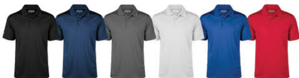
Black Navy Charcoal White Royal Blue Flame Red

Features: - Interlock knit fabric - 3 Button placket with open sleeve (Men's/Women's) - Premium ribbed collar