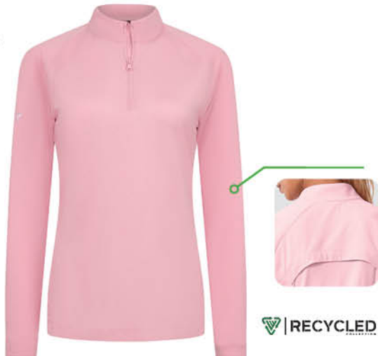
FLEX - EH01L XS - XL XS - XXL

US $70(A) CDN $80(A) 90% Recycled Polyester, 10% Spandex