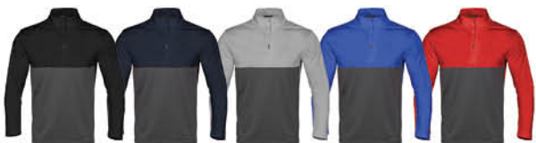
Black/Charcoal Navy/Charcoal Pebble/Charcoal Team Royal/Charcoal Flame Red/Charcoal