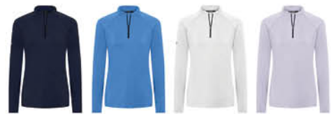
Navy Alaska White Evening Haze