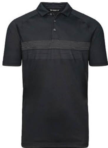
MASON - HY62L S - 3XL S - XXL