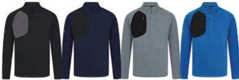
Black Navy Pebble Blue Heron