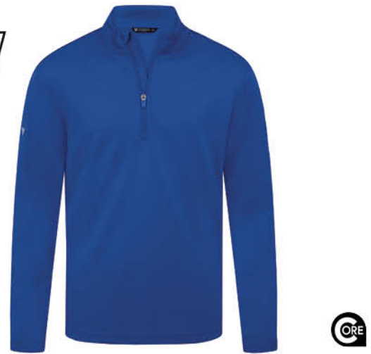
HERON - IS59L S - 3XL