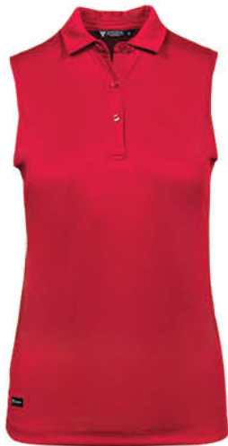
VENICE - PM08L XS - XXL