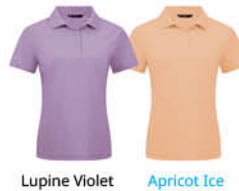
Lupine Violet Apricot Ice