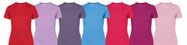
Solid Red Heather Lupine Heather Purple Reign Heather Blue Orchid Heather Raspberry Heather Dahlia Heather Hazy Pink