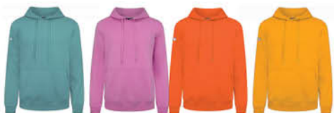
Marine Blue Cyclamen Orange Gold