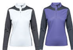
White/Charcoal Purple Reign/Charcoal