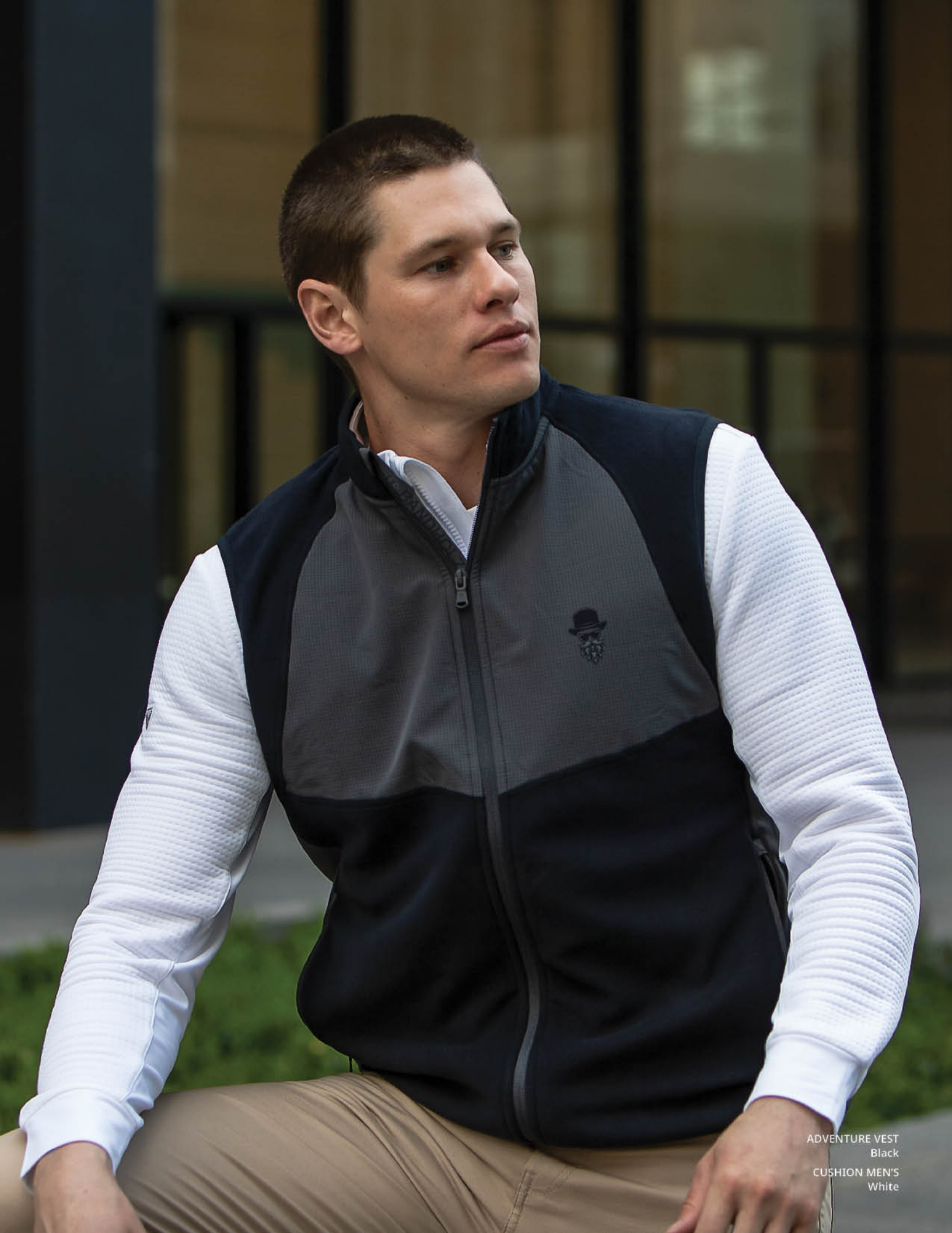
ADVENTURE VEST Black CUSHION MEN'S White