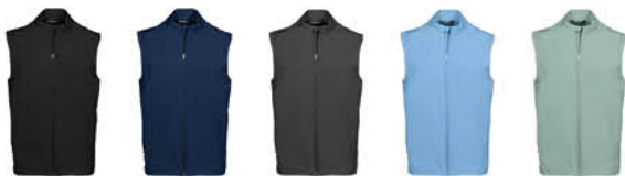
Black Navy Charcoal Nassau Eucalyptus