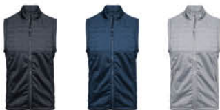
Black Navy Pebble