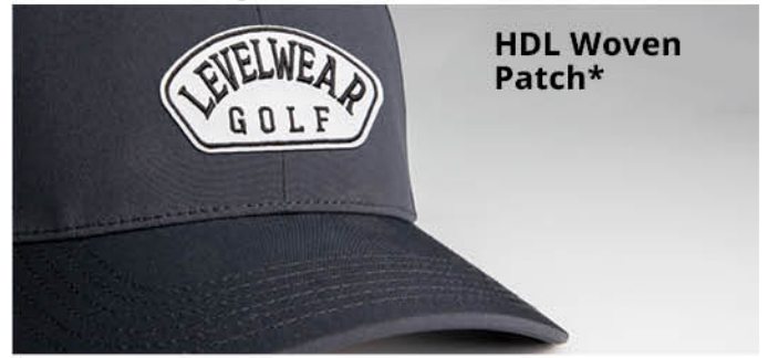
HDL Woven Patch*