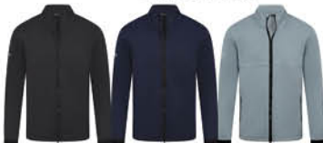
Black Navy Pebble