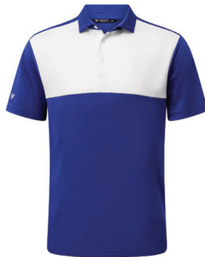
HORIZON - PM7AL S - 3XL