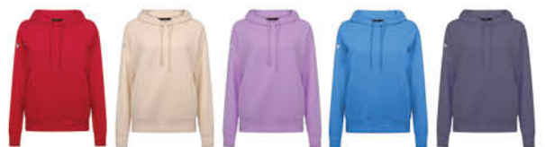
Flame Red Sand Lupine Blue Orchid Purple Reign