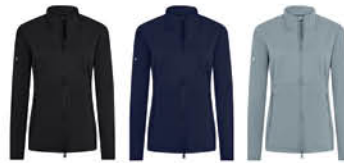
Black Navy Pebble