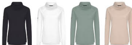
Black White Iceberg Green Sand