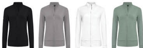
Black Gull White Iceberg Green