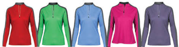
Flame Red/Charcoal Kelly Green/Charcoal Blue Orchid/Charcoal Dahlia/Charcoal Purple Reign/Charcoal