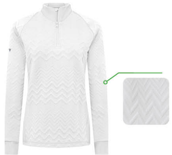
AFTERGLOW - JO20L XS - XXL

US $90(A) CDN $100(A) 97% Polyester, 3% Spandex