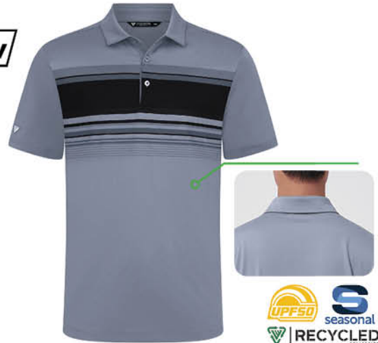
ONWARD - XE70L S - XXL

US $70(A) CDN $80(A) 92% Recycled Polyester, 8% Spandex