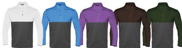
White/Charcoal Azure/Charcoal Bordeaux/Charcoal Brown/Charcoal Delta Green/Charcoal