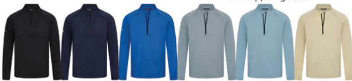
Black Navy Blue Heron Pebble Overcast Wheat