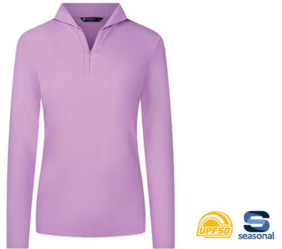
TREASURE LONG SLEEVE - NI03L XS - XXL

US $80(A) CDN $90(A) 67% Nylon, 33% Spandex