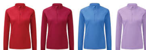
Flame Red Cardinal Alaska Lupine Violet