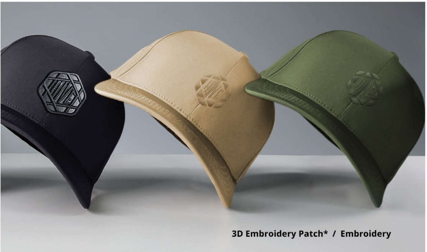
3D Embroidery Patch* / Embroidery