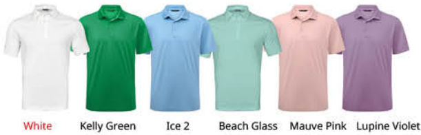
White Kelly Green Ice 2 Beach Glass Mauve Pink Lupine Violet