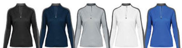
Black/Charcoal Navy/Charcoal Pebble/Charcoal White/Charcoal Team Royal/Charcoal