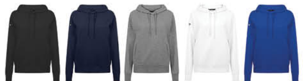
Black Navy Heather Pebble White Team Royal