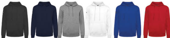
Black Navy Heather Pebble White Team Royal Flame Red