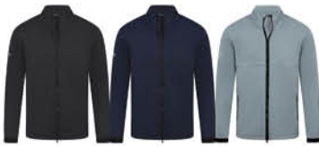
Black Navy Pebble