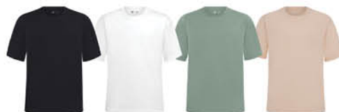
Black White Iceberg Green Sand