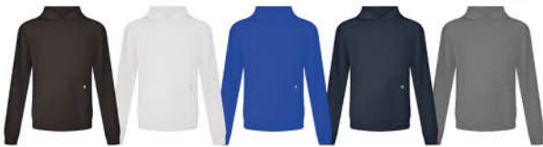
Black White Team Royal Navy Pebble