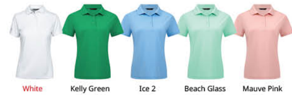
White Kelly Green Ice 2 Beach Glass Mauve Pink