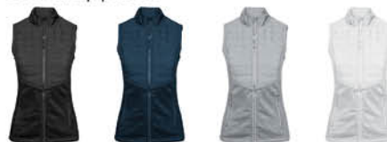
Black Navy Pebble White