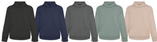
Black Navy Grey Stone Iceberg Green Sand