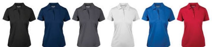
Black Navy Charcoal White Team Royal Flame Red