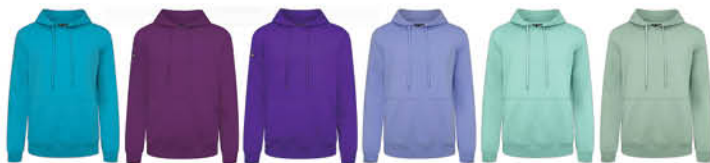
Norse Blue Bordeaux Purple Hydrangea Beach Glass-Mint Green Tea