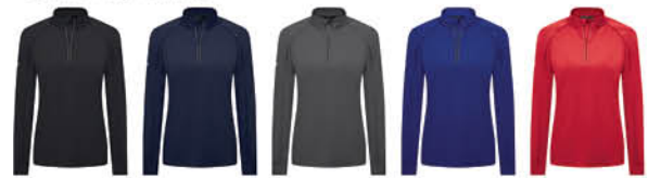
Black Navy Charcoal Team Royal Flame Red