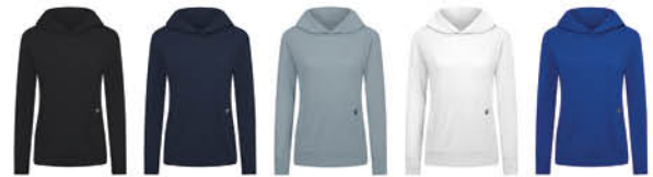
Black Navy Heather Steel Grey White Team Royal