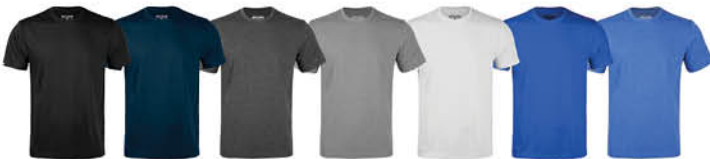
Black Navy Heather Charcoal Heather Steel Grey White Team Royal Heather Royal