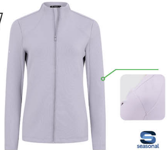
DIVE FULL ZIP - MS01L XS - XL