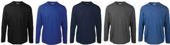
Black Team Royal Solid Navy Heather Charcoal Heather Royal