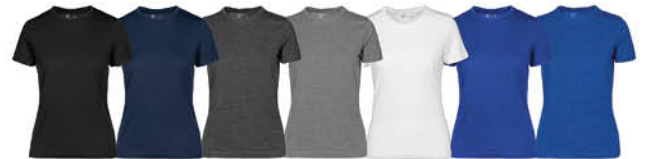
Black Solid Navy Heather Charcoal Heather Steel Grey White Team Royal Heather Royal