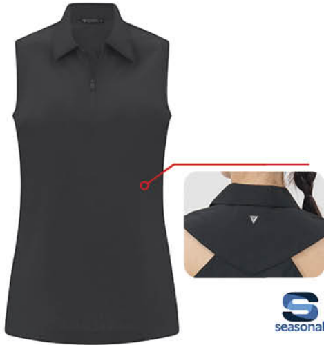
GRACE - OE00L XS - XL

US $70(A) CDN $80(A) 90% Polyester, 10% Spandex