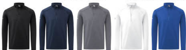
Black Navy Heather Charcoal White Team Royal