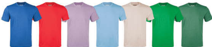
Heather Blue Heron Solid Red Heather Lupine Sky Blue Sand Heather Kelly Green Heather Rider Green