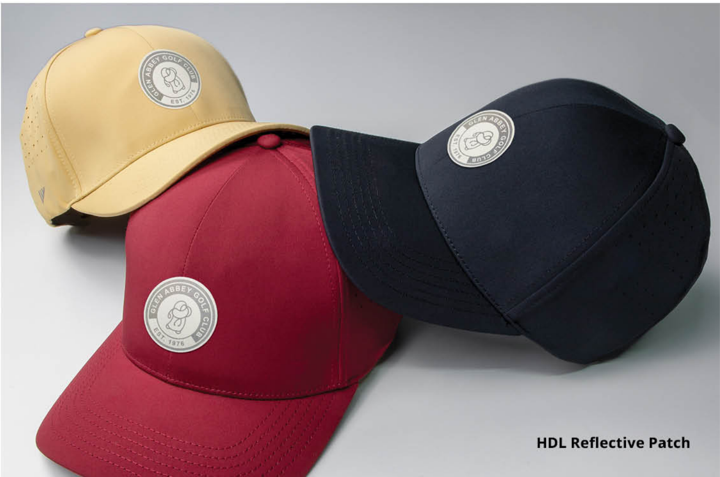
HDL Reflective Patch