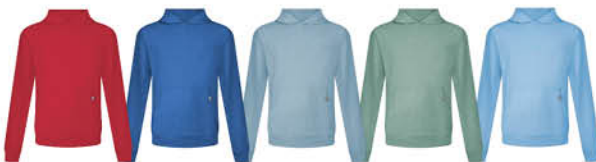
Flame Red Heather Blue Heron Heather Overcast Heather Eucalyptus Ice 2