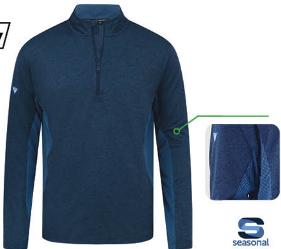
WAFFLE - DJ50L S - XXL