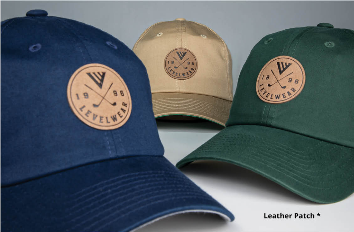
Leather Patch *