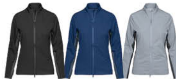
Black Navy Pebble