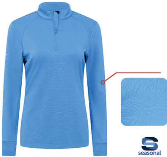
FANTASY - EI00L XS - XL

US $90(A) CDN $100(A) 92% Polyester, 8% Spandex