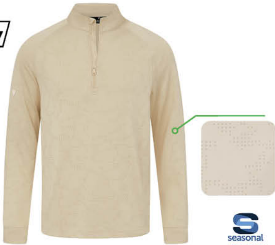
TREK - CQ50L S - XXL

US $90(A) CDN 100(A) 94% Polyester, 6% Spandex