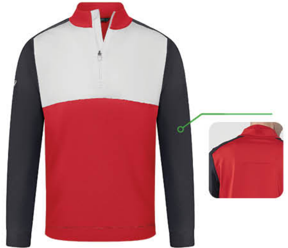
SPLICE - LN52L S - 3XL

US $90(A) CDN 100(A) 92% Polyester, 8% Spandex