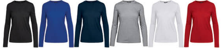
Black Team Royal Navy Heather Steel Grey White Flame Red