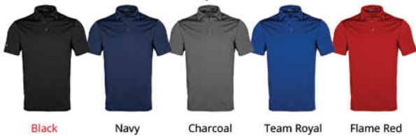
Black Navy Charcoal Team Royal Flame Red