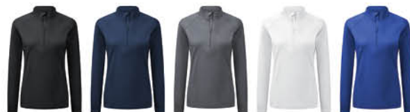
Black Navy Heather Charcoal White Team Royal