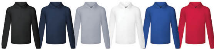
Black Navy Pebble White Team Royal Flame Red