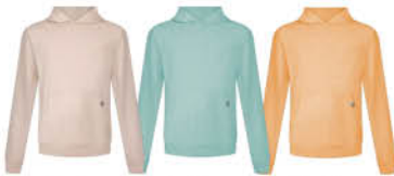
Sand Heather Beach-Glass Heather Sorbet