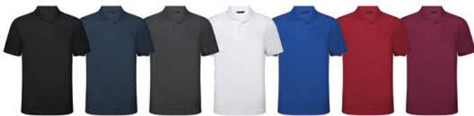
Black Navy Charcoal White Team Royal Flame Red Cardinal

Features: - Moisture wicking - High-low hem detail with side slits (Men's/Women's) - Flat knit collar