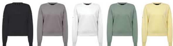
Black Gull White Iceberg Green French Vanilla