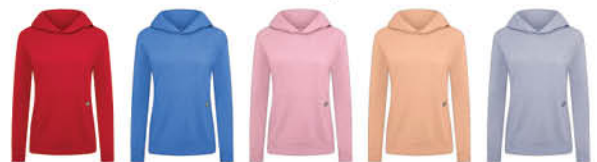
Flame Red Heather Alaska Heather Hazy Pink Heather Apricot Ice Heather Evening Haze