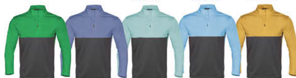
Kelly Green/Charcoal Hydrangea/Charcoal Marine Blue/Charcoal Ice 2/Charcoal Gold/Charcoal