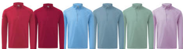
Flame Red Cardinal Ice 2 Overcast Eucalyptus Lupine Violet