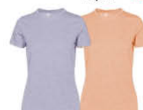
Heather Evening Haze Heather Apricot Ice