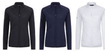
Black Navy White