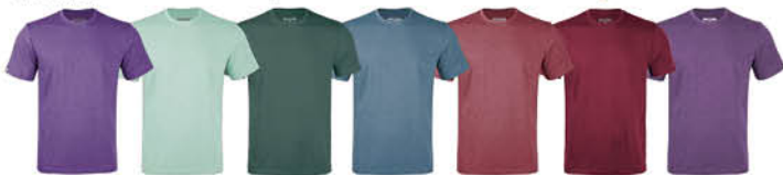
Heather Purple Heather Beach Glass Forest Green Heather Stellar Blue Heather Cardinal Cardinal Heather Bordeaux