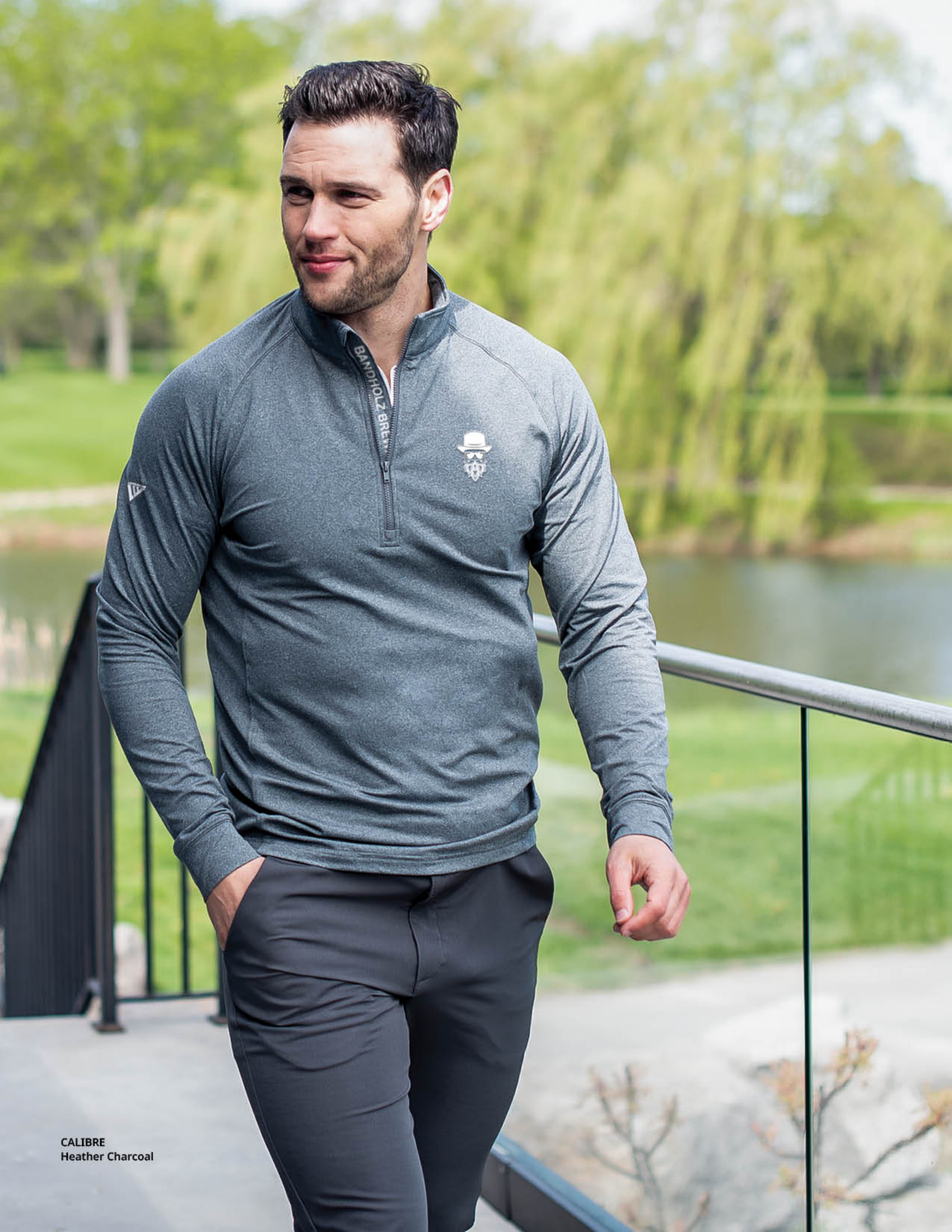
CALIBRE Heather Charcoal