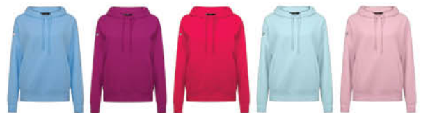
Mute Blue Dahlia Raspberry Blue Glass Fairy Tale