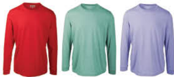
Solid Red Heather Marine-Blue Heather Hydrangea