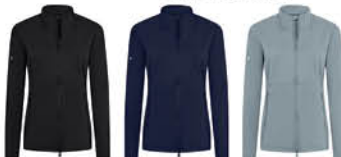
Black Navy Pebble