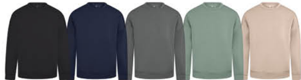
Black Navy Grey Stone Iceberg Green Sand