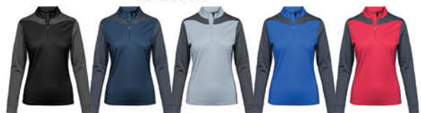
Black/Charcoal Navy/Charcoal Pebble/Charcoal Team Royal/Charcoal Flame Red/Charcoal