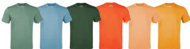
Heather Eucalyptus Heather Overcast Delta Green Heather Sorbet Orange Heather Gold