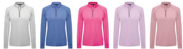
White Ice 2 Deep Pink Lupine Violet Hazy Pink