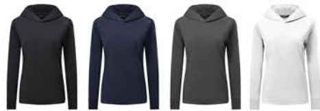
Black Navy Charcoal White