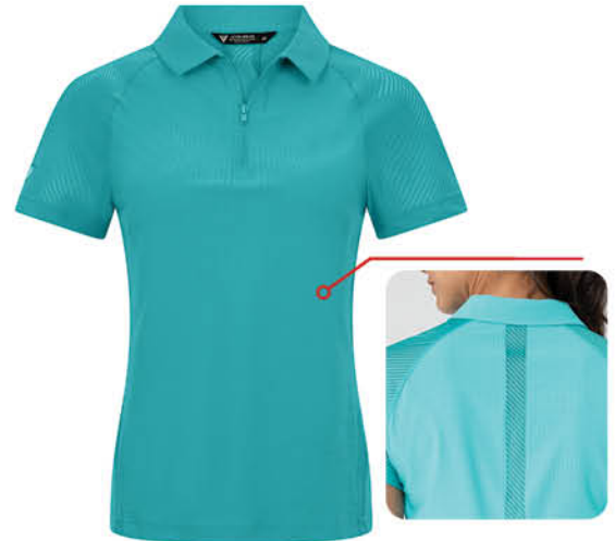
TANDEM - HG00L XS - XL

US $70(A) CDN $80(A) 63% Polyester, 37% Elastane Contrast: 87% Polyester, 13% Spandex