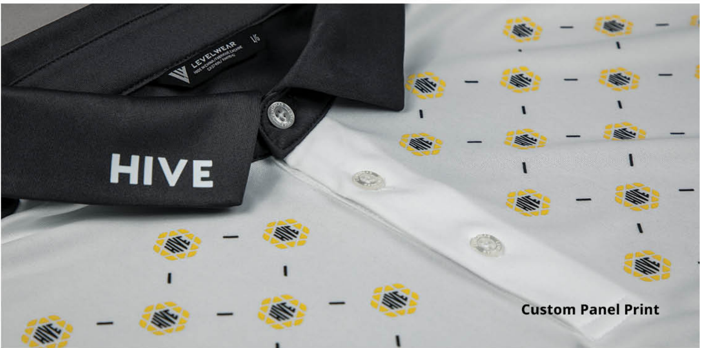
Custom Panel Print