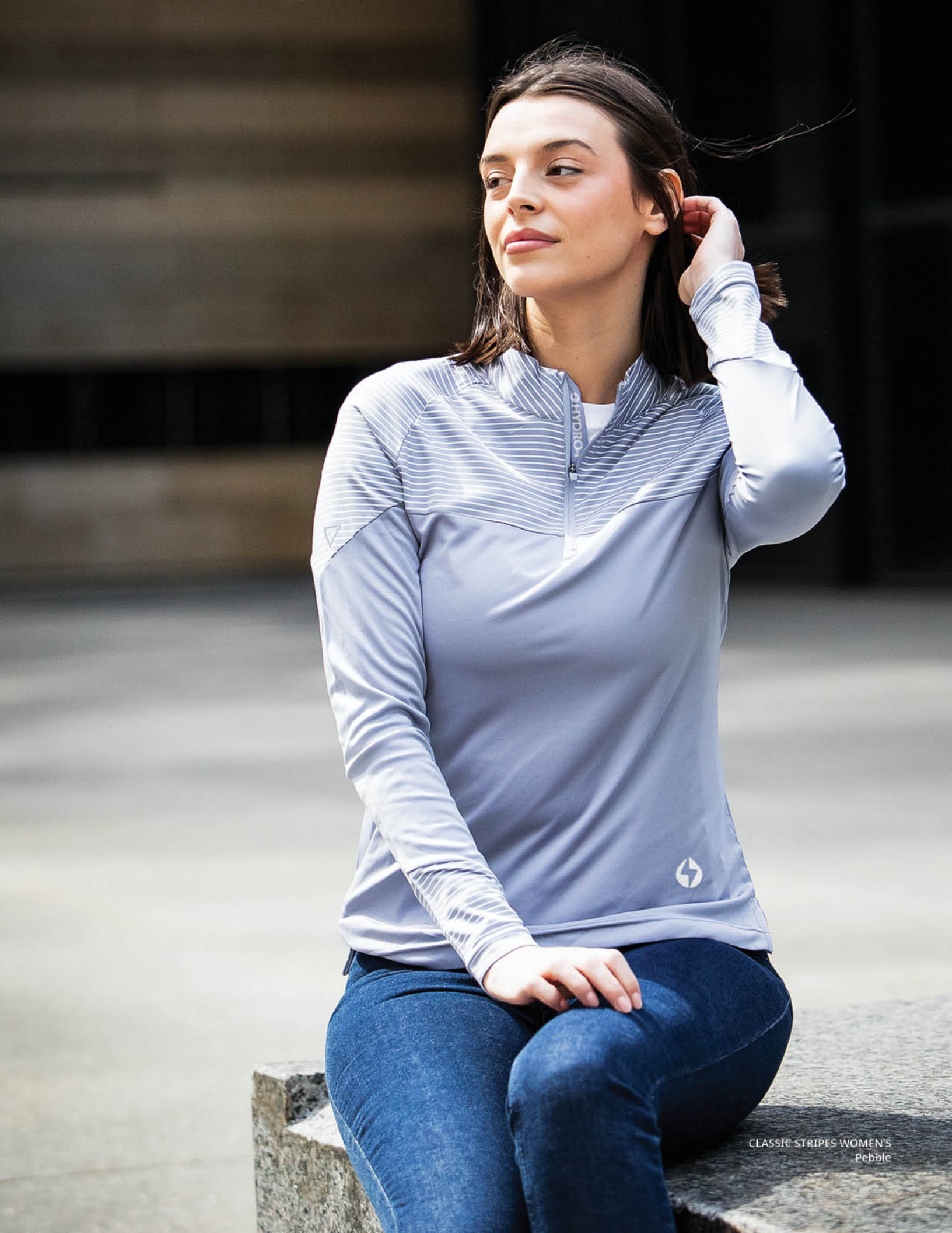
CLASSIC STRIPES WOMEN'S Pebble