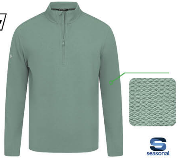
MARATHON - EG50L S - XXL

US $90(A) CDN $100(A) Textured Cotton Blend - 63% Cotton, 33% Polyester, 4% Spandex