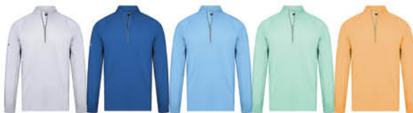
White Blue Heron Ice 2 Beach Glass Mint Sorbet