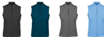
Black Navy Charcoal Blue Orchid