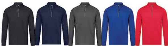
Black Navy Charcoal Team Royal Flame Red