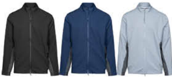
Black Navy Pebble