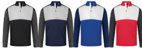
Black/White/Charcoal Navy/White/Charcoal Team Royal/White/Navy Flame Red/White/Black