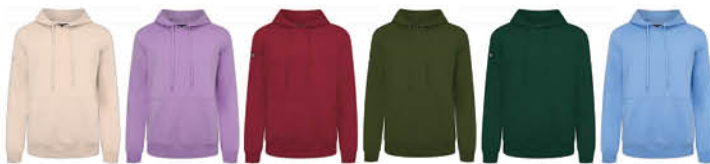
Sand Lupine Cardinal Delta Green Forest Green Ice 2