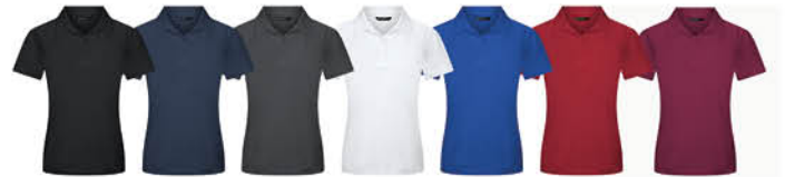
Black Navy Charcoal White Team Royal Flame Red Cardinal