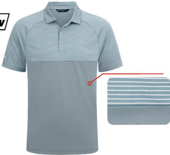
MEN'S CLASSIC STRIPES MEN'S - HZ53L S - 3XL S - XXL