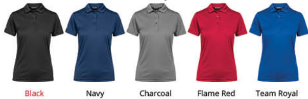
Black Navy Charcoal Flame Red Team Royal